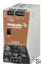
Ecoline Single Phase